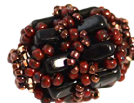
Beaded Bead by TrendSetter, Eileen Barker

Build 3-dimensional designs that transcend previous boundaries.