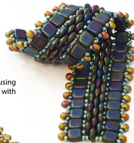
Bracelet by TrendSetter, Eileen Barker

Create a bracelet foundation using basic stitches faster than with traditionally used seed beads.